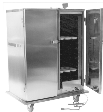
2285-HIN-1-1-2828-1015 (with options)

Better food service equipment – standard models and custom designs.