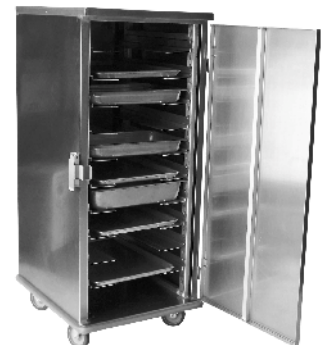
9150-11 (with optional wrap around bumper)