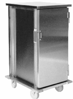
S/S Model 2200-1-F-1507