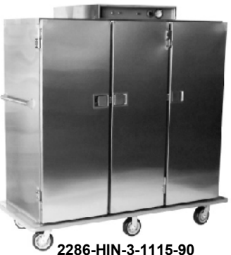
(with correctional package)

NOTE: Prices are based on a minimum quantity of 5 units. For quantities fewer than 5, consult factory. These cabinets are also available without the heating unit. Consult factory.